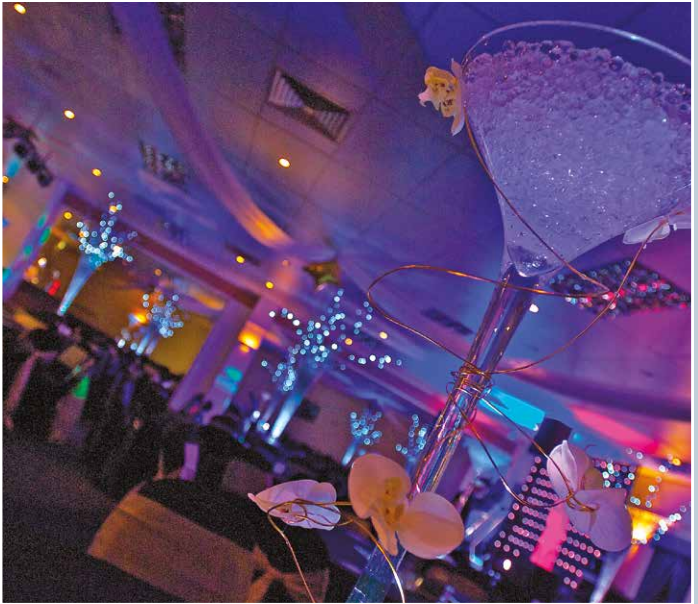
WEDDINGS AT SELECT SECURITY STADIUM HALTON